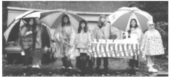
Girl Scout Troop #570 ready for thirsty runners