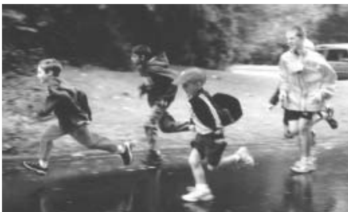
Rain was no match for Kids-K participants!