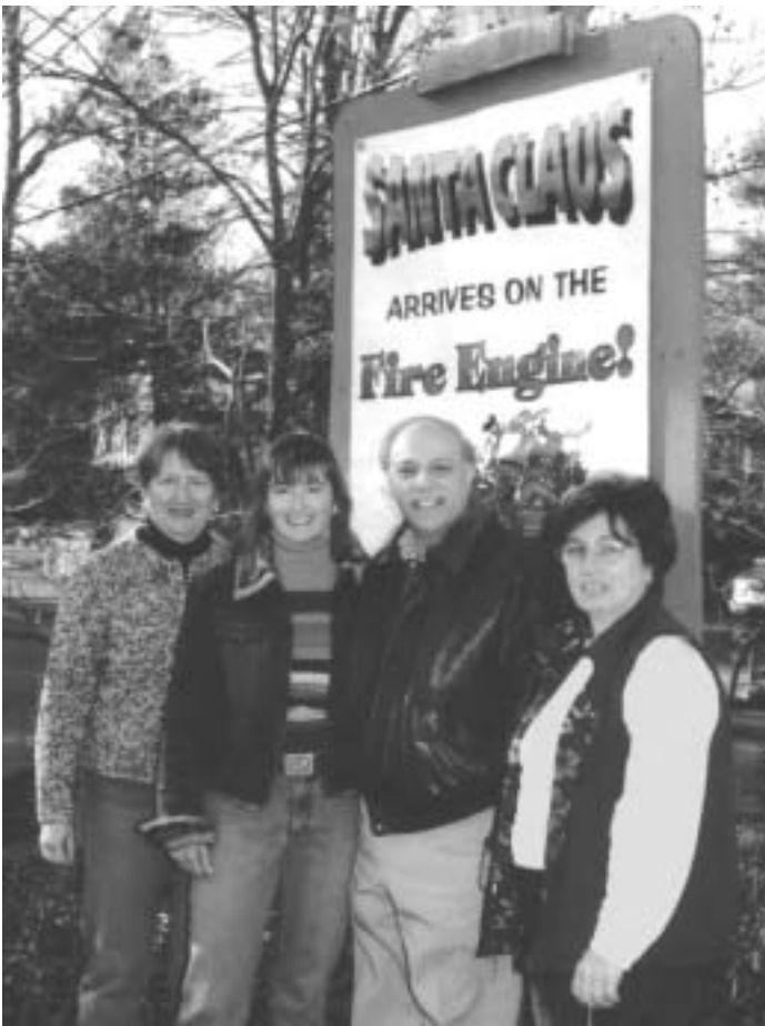
A Coven of Elves Sighted in Silvermine